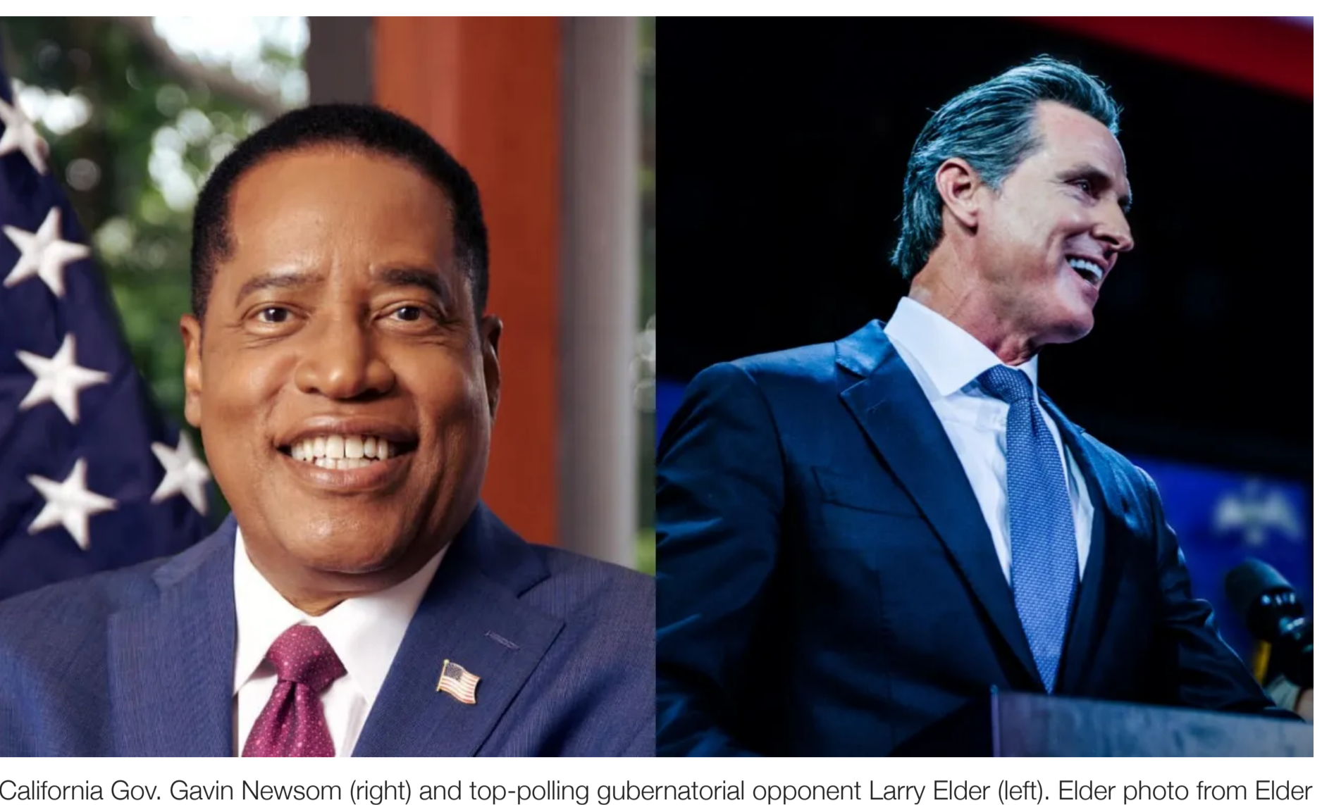
California Gov. Gavin Newsom (right) and top-polling gubernatorial opponent Larry Elder (left).

Tuesday marks the arrival of the 2021 California Gubernatorial Recall Election, the last day for Californians to vote on whether Gov. Gavin Newsom will complete his first term in charge of the state or have the remainder served by one of the candidates looking to unseat him.